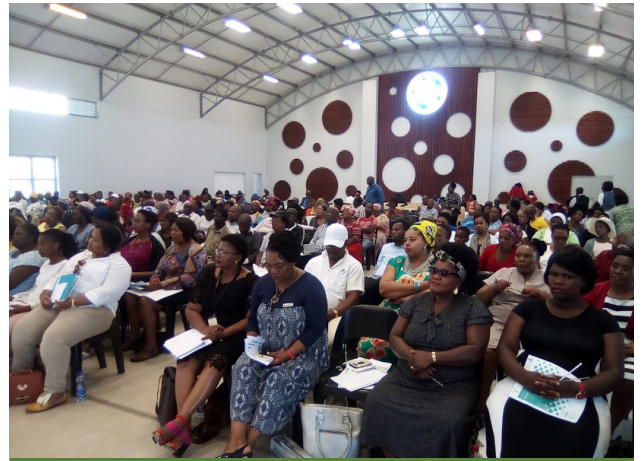
Delegates at the Cooperative Summit

Chris Hani Cooperative Development Centre (matters of Cooperative Development) – available in Queenstown 045 838 8086 / www.chrishanicdc.org/ info@chrishanicdc.org