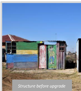
Structure before upgrade