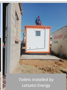
Toilets installed by Letsatsi Energy