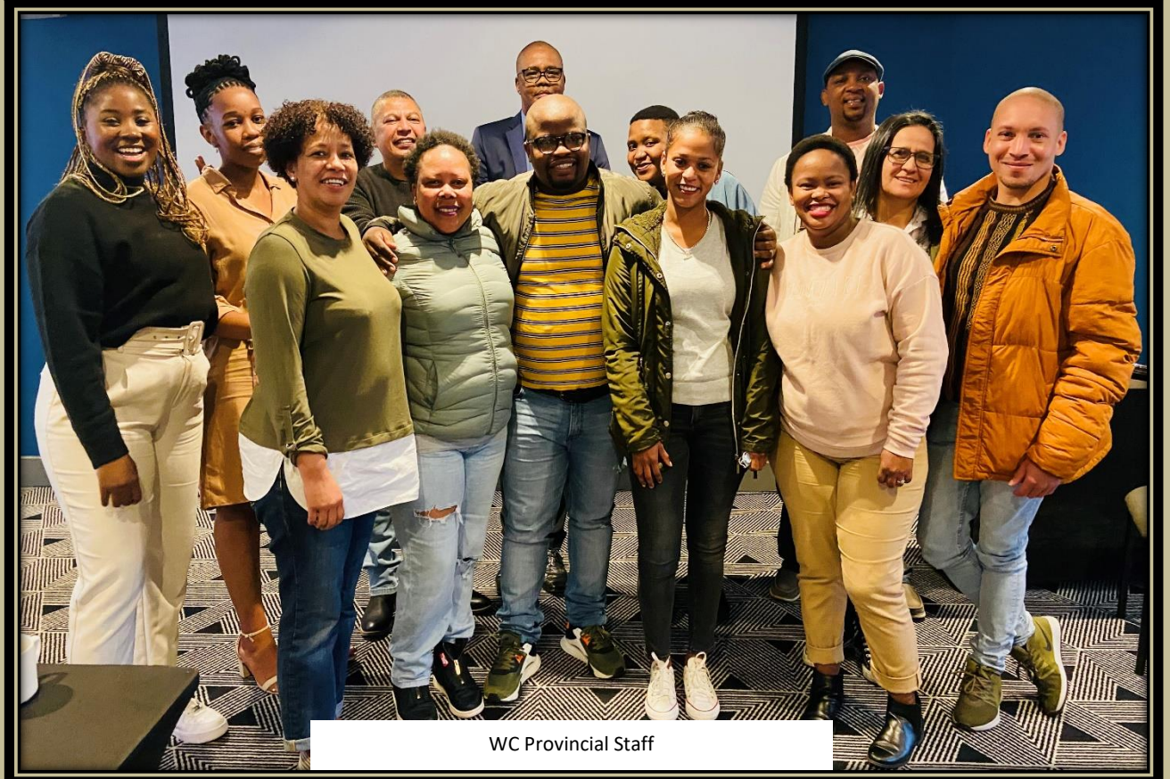
WC Provincial Staff