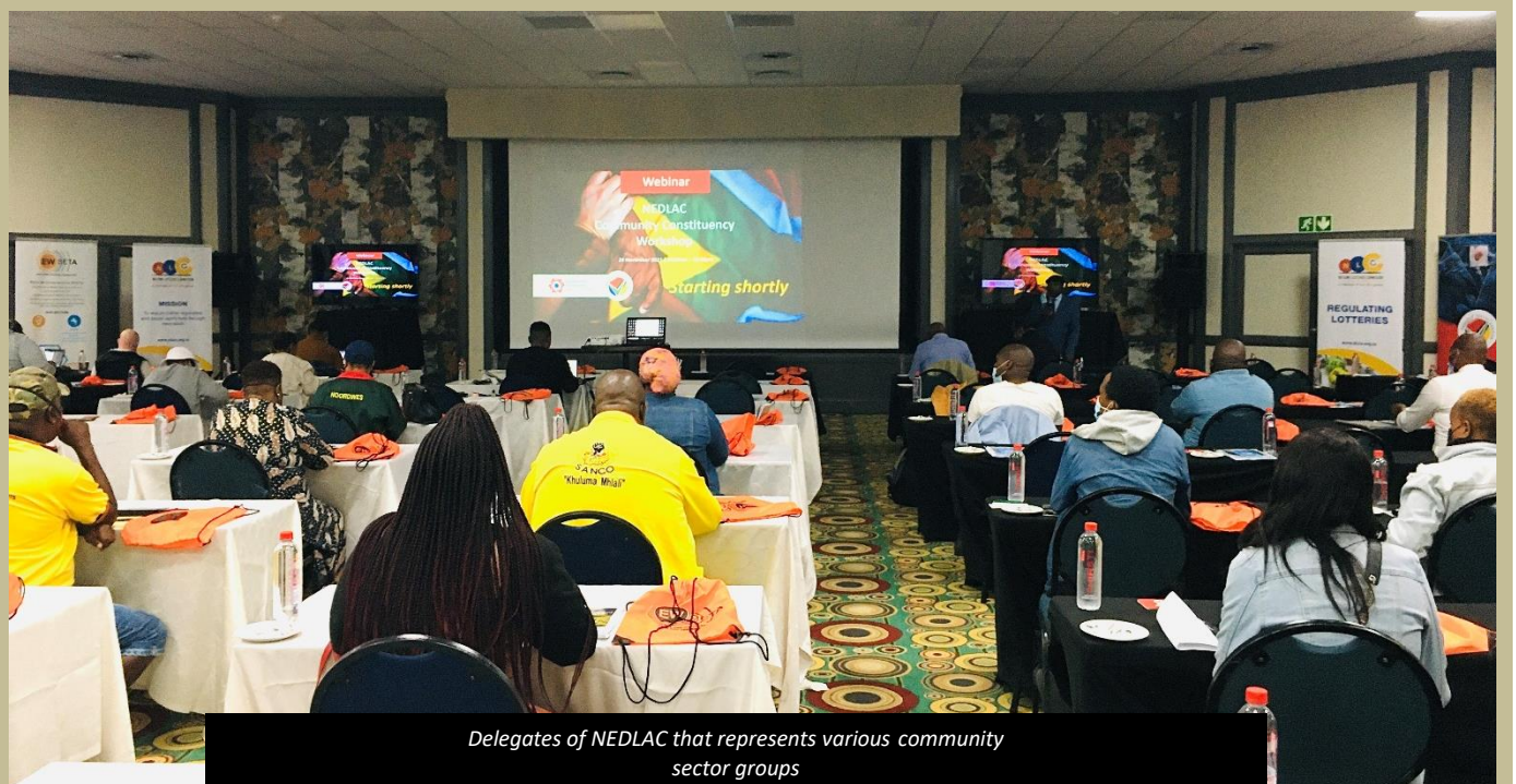
Delegates of NEDLAC that represents various community sector groups

The workshop was well attended and all the Nedlac legs were represented by their leadership. The leadership have pledged to form their own district and provincial structures that will work together to minimize the challenges they face in the province which include working in silo's and state of fragmentation, preference in the awarding of funding and opportunities and so on.