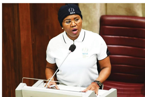
Minister Lindiwe Zulu delivering her maiden NCOP Budget Vote.

The coordination of the department and its entities through the portfolio approach is critical to address these outlined priorities and others. It is furthermore important for the department to engage on a broader strategy of working with other government departments and institutions in order to address the social development challenges facing South Africa. This broader strategy will ensure that the department is able to table practical and pragmatic programmes that will materialise the portfolio approach with other government