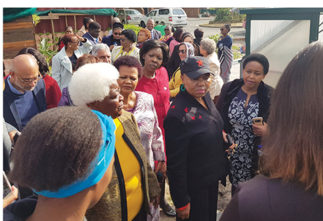
Minister Lindiwe Zulu and officials on a site tour of Mhoni Gini in Athlone, Cape Town.