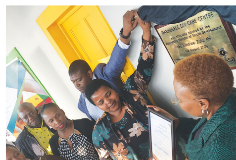
Minister Lindiwe Zulu and Social Development MEC, Siphokazi Mani unveil a plaque at the official opening of Masibulele Day Care Centre in Mdantsane, East London.

When delivering her maiden Budget Vote 17, in July at the National Assembly, under the theme "Working Together To Empower Communities For Sustainable Livelihoods", the Minister highlighted that the department's approach is premised on the understanding that the provision of social grants alone, is not sufficient to lift beneficiaries out of poverty and is not sustainable. Social development is a societal issue, meaning all sectors in South Africa have a critical role to play in reaching social development goals. It is therefore important to agree that intra-departmental units and agencies should work together in dealing with socio-economic issues, particularly those affecting the Department of Social Development's mandate.